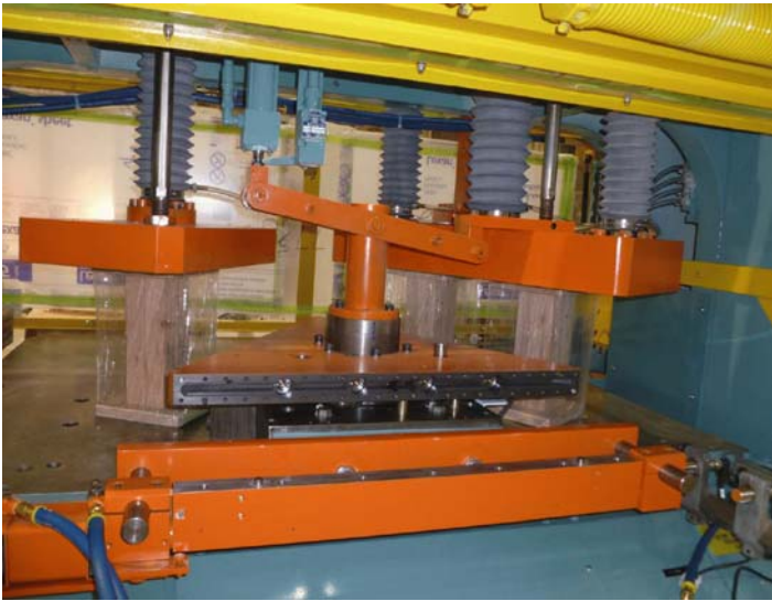
BLOW AND PREFORM CLAMPS