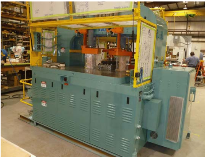
REAR VIEW - 85S