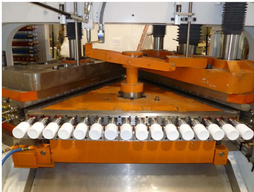
Jomar Model 135 120 ml, 16 cavities

Jomar offers tooling for all of our existing machines as well as turnkey systems. Our turnkey systems consist of matching your new Jomar to the tool that you have chosen. We design and test the machine and tool together.