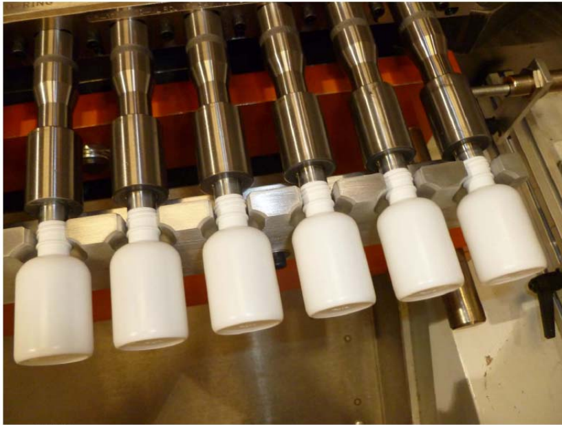
Jomar Model 20 LDPE Dropper Bottle, 6 cavities

It is true that you will always find cheaper tooling throughout Asia but the quality will also be much less. The cycle times may be 10-15% longer. Repairs may be required more frequently due to the metals they selected.